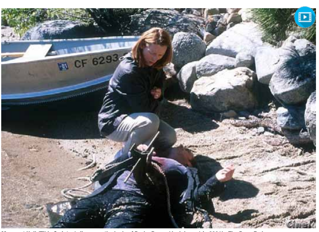
Margaret Hall (Tilda Swinton) discovers the body of Darby Reese (Josh Lucas) in 2001's The Deep End

The Deep End follows the same pattern as the book and previous film: Darby's accidental death, the mother's attempt to cover up the death by submerging the body