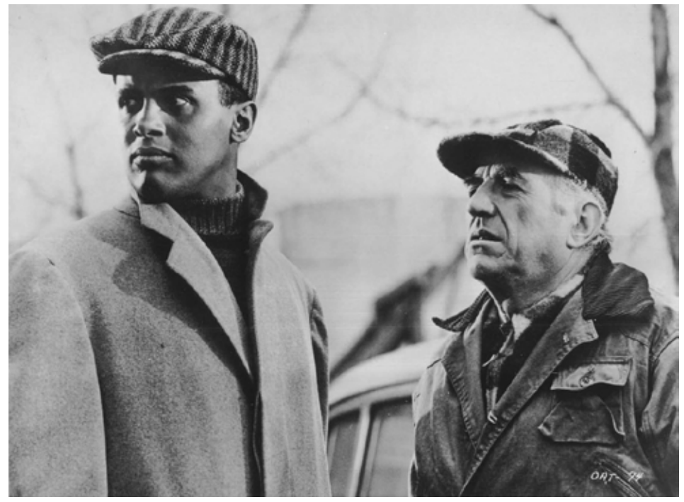
Tension builds as Ingram and Burke await Slater for the last meet-up before the heist

As he approached Novak's door he fashioned a discreet and self-effacing