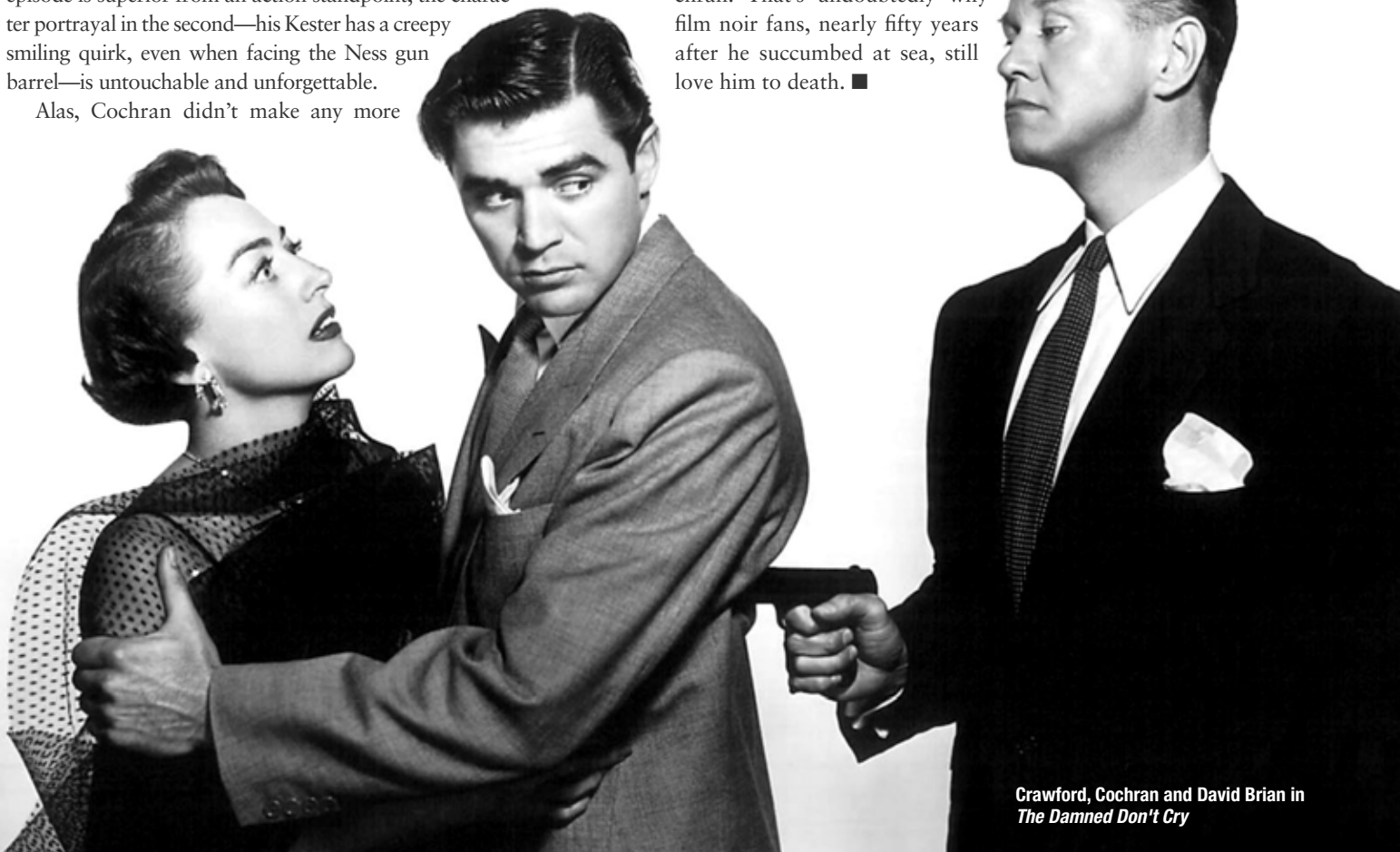
Crawford, Cochran and David Brian in The Damned Don't Cry